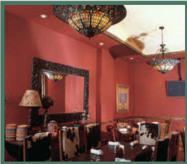
Axel's Bonfire Restaurant

HARMONY IS AN ENVIRONMENTALLY PREFERABLE COATING FEATURING: